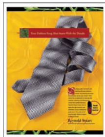
8.5" x 11" Letter